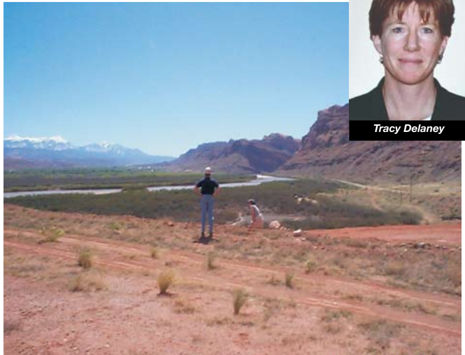
The Atlas Uranium Mill site