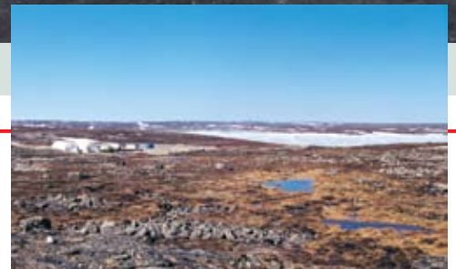
Jericho pit area

Commercial diamond production may commence as early as 2003, and the life of mine is approximately eight years.