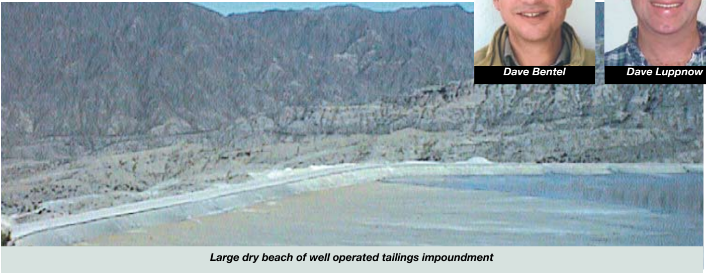
Large dry beach of well operated tailings impoundment

Good operational management encompasses fluid and tailings solids management elements, and both aspects are integral to the formulation of the impoundment closure strategy. Also critical, from costing and risk management perspectives, are final beach profiles, supernatant pool location and storm diversion characteristics.