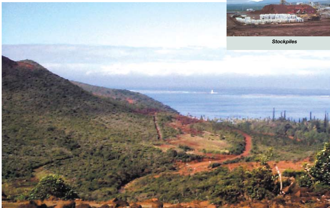
Views from the INCO pilot plant