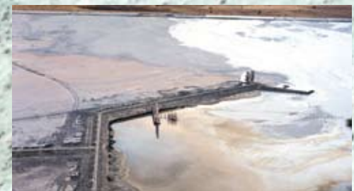
supernatant pool within poolwall confines