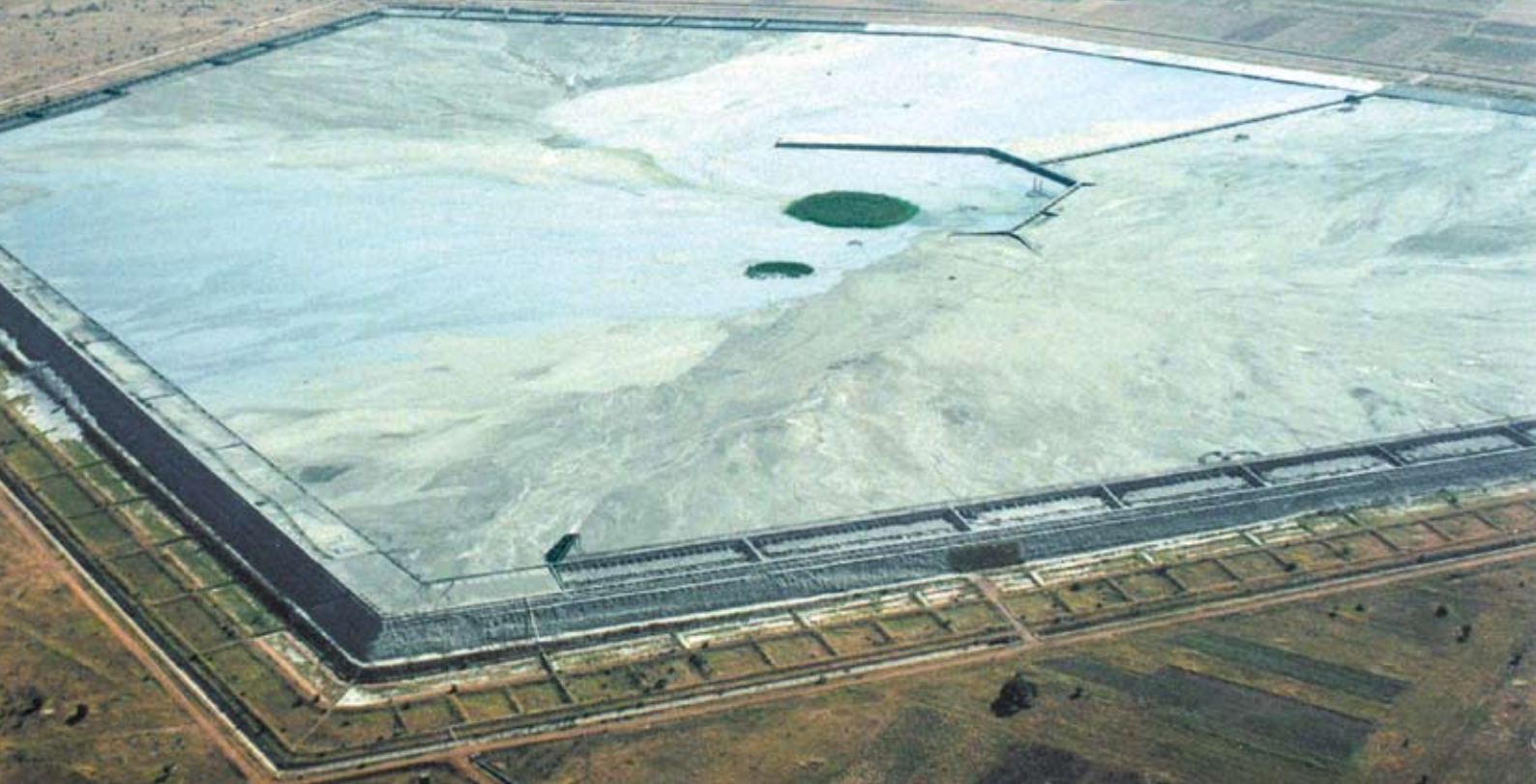
Typical platinum tailings dam

A major client in the platinum industry intends to increase production at one of its mines at the earliest opportunity. SRK was appointed to determine the maximum allowable rate of rise on the tailings dam.