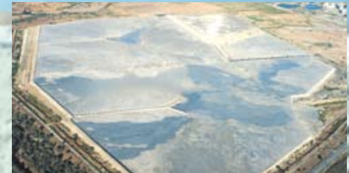
multi compartment tailings disposal