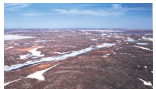
Northeast view over project area