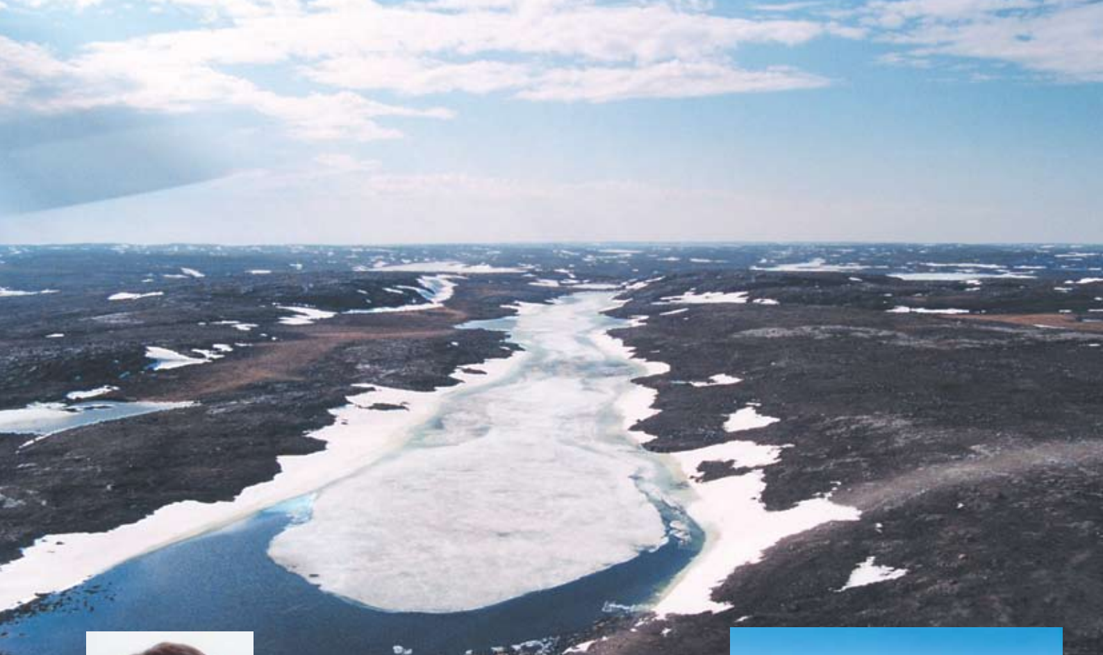
The lake proposed for use as the PKCA