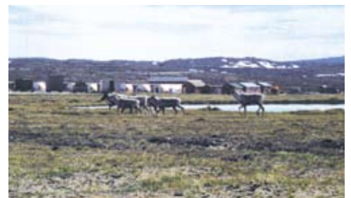
Caribou near the camp