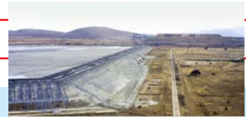
slope angles & other aspects are monitored