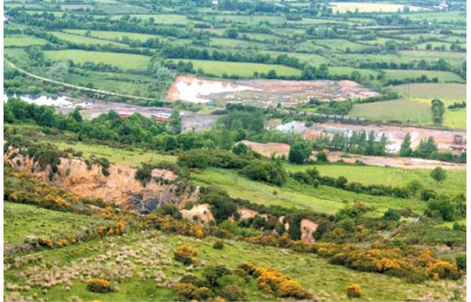
View past mining subsidence to abandoned plant structures and tailings lagoon

S nuggled against the Silvermines Mountain in County Tipperary is laid out a row of abandoned mines like a theme park on the history of mining in Ireland. The area has been exploited for over a thousand years for lead, silver, zinc, copper, barytes and sulphur. The mining remains range from shallow open-pits from the Middle Ages, through nineteenth century beam engine houses and furnaces, to extensive underground lead-zinc workings from the mid-twentieth century, finally ending with a large open-pit for baryte which closed in 1992.