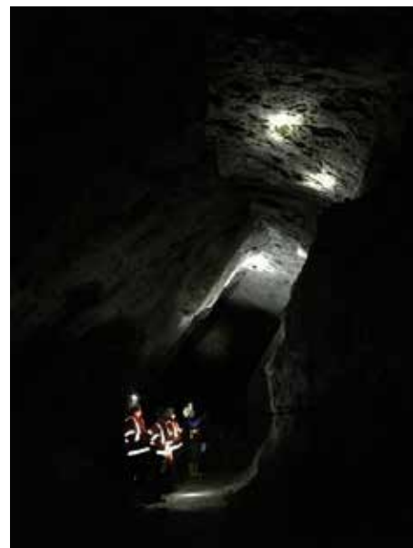
Figure 3 - Open stope created during the trial mining at Wolfsberg in 1985

DRA Global (“DRA”) will lead the PFS and integrate the work of all consultants and undertake the engineering and capital and operating cost estimates for the processing and infrastructure. SRK UK will develop mine design to PFS level and design the drilling programme to upgrade Inferred resources to Indicated category so they can be included in a future definitive feasibility study.